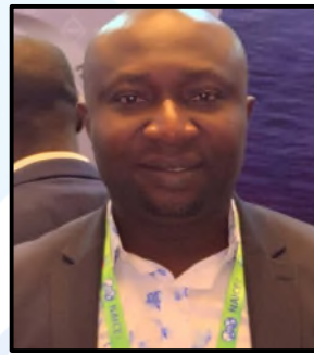
Mene Dun-Mene Member