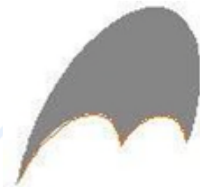
MATPATSON PETROLEUM SERVICES LIMITED